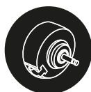
Motor de ventilador DC