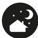
Baixo nível de ruído