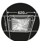
Novo design de painel 620*620mm