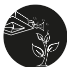
Saída de ar fresco